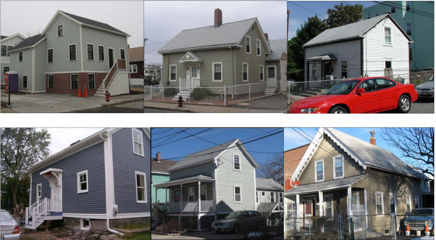
Top: 25 Clyde Street (1860); 342 Lowell Street (1861); 60 Linden Avenue (1861), Bottom: 27 Dane Avenue (c.1874); 80 Properzi Way (c.1850), 8 Mount Pleasant (1850)

Predominant differences between the comparable dwellings and the subject dwelling are the number of windows, the level of architectural integrity, and the heights of the brick foundation. These comparable dwellings have construction date between 1852 and 1874. Most of the comparable structures have similar size and massing, a center-hall entry, and a similar fenestration pattern.