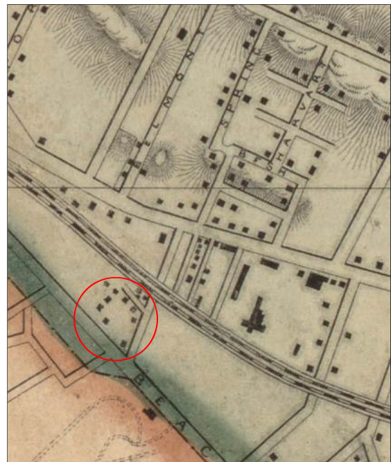
1858 Walling map with Kent Street and Kent Court circled in red