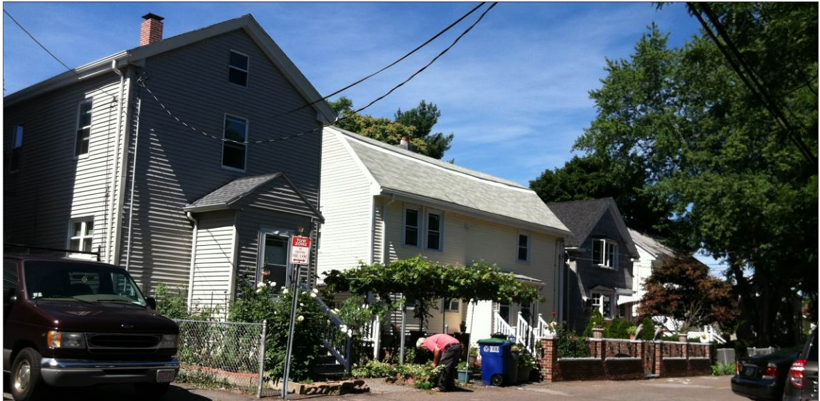
Corner of Kent Street and Kent Court, 2013.

Site visits illustrate that the subject structure is isolated from the other residential structures, located on Kent Street and Kent Court, which share the same historic context. However, the subject dwelling is still within a close proximity to these dwellings and, together, these structures illustrate a period in Somerville that has been predominantly lost, other than a few interspersed dwellings along Somerville Avenue.